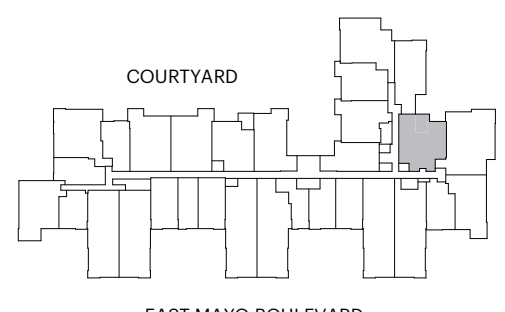
EAST MAYO BOULEVARD